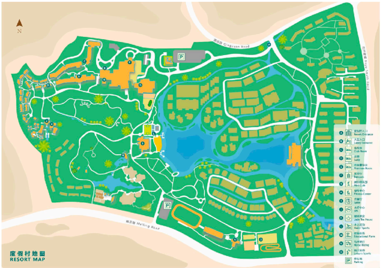
度假村地圖 RESORT MAP